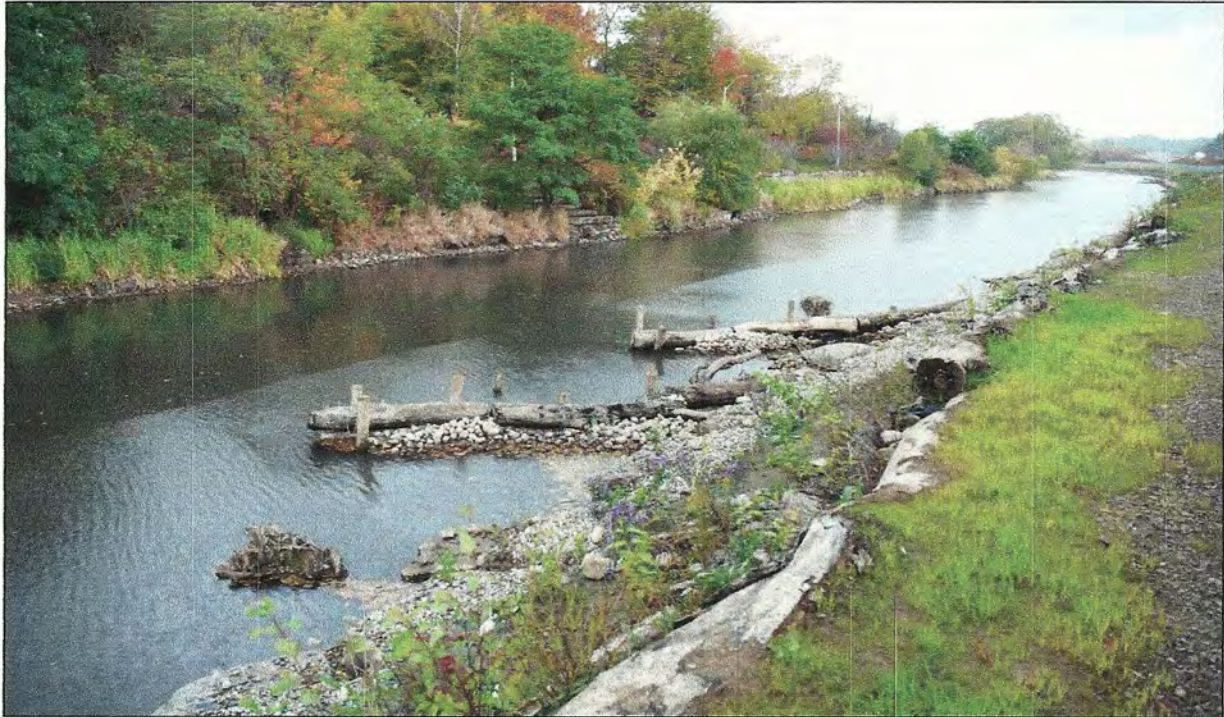
Figure 5: Completed bank stabilization; live crib wall beginning to grow atop LCS with log vanes as habitat enhancement in the creek channel.