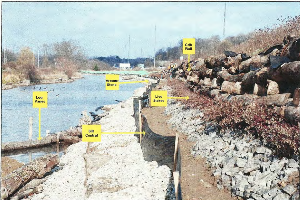
Figure 4: Crib wall placed atop LCS to stabilize bank in conjunction with armour stone. Log vanes are a habitat enhancement.