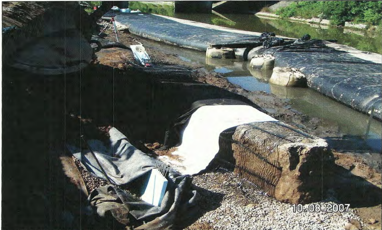
Figure 3: LCS with GCL membrane, Geogrid in reconstructed bank of armourstone (AquaDam™ flexible coffer dam system used to isolate work area from creek in background).